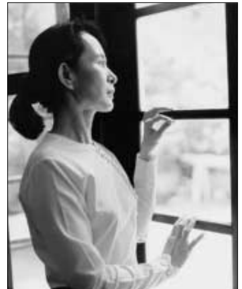
Nobel Peace Prize winner, Aung San Suu Kyi.

oppression in Burma and her plight: "The words of protest at her detention from world leaders ring hollow when they do not translate into action," the South African anti-apartheid leader wrote in the International Herald Tribune . "There in Hanoi, state terrorists from Myanmar (Burma) will sit and dine with your leaders," he wrote.