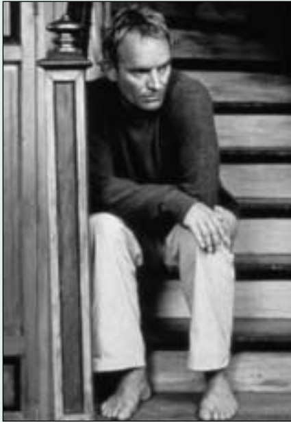
Sting, a contributor to For the Lady album.