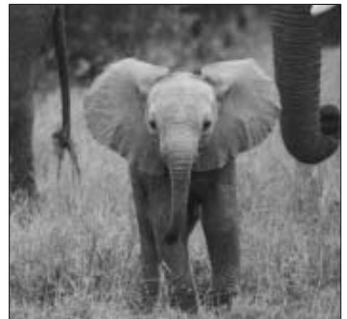
Burmese elephant calves are being hunted in forests in Burma.

According to the Asian Conservation Alliance Task Force (ACATF), a coalition of non-government groups, the future is bleak for Burma's endangered elephant species. Thai poachers are expanding their network and are capturing dozens of endangered wild baby elephants in Laos and Burma each year to feed growing demand from circuses, zoos and travelling shows. Speaking on the radio station – the Democratic Voice of Burma, the ACATF revealed that approximately 60 baby elephants are captured from forests each year in Thailand and the two neighbouring states, eventually to be sold off to merchants - mainly in China.