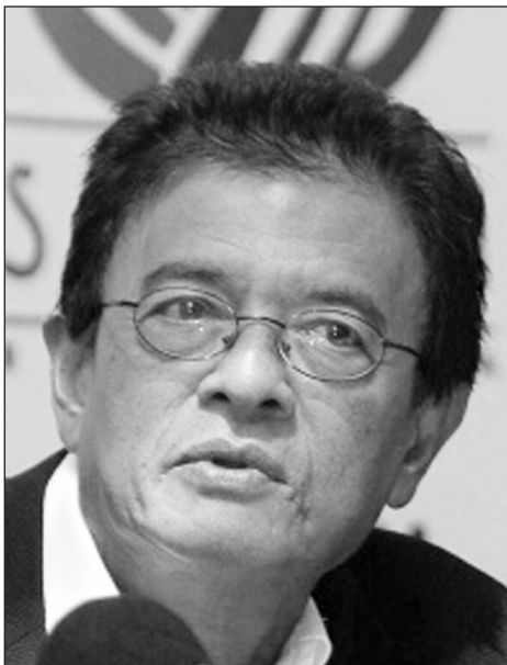
Pictured is the former UN special envoy for Burma, Mr Razali Ismail.