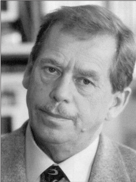
Mr Václav Havel, former President of the Czech Republic – "the people in Burma need to know that the international community, represented in this case by the Security Council, did not forget their plight", he said.

Václav Havel, former President of the Czech Republic and Desmond M. Tutu, Nobel Peace Prize Laureate and Archbishop Emeritus of Cape Town, have praised the UN Security Council for holding a discussion on the situation in Burma. The discussion took place on Friday 16 December. They also commended the United States, which spearheaded the effort and Romania and the United Kingdom, which provided leadership on the initiative through their service as President of the Security Council in October and December respectively.