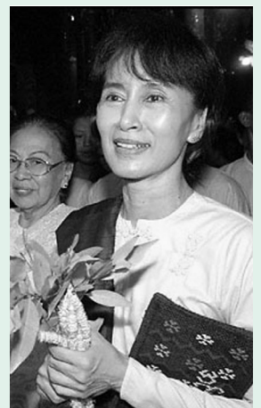
Pictured is 60-year-old Aung San Suu Kyi.

undoubtedly has the necessary stature, vision and integrity. After graduating from Delhi and Oxford, she served the UN in New York from 1969 to 1971 and in Bhutan the following year. Whatever the outcome, Equality Now's promotion of her, and the