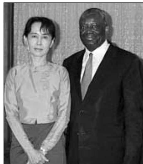
Aung San Suu Kyi and UN Under-Secretary Ibrahim Gambari pictured after their meeting in Rangoon.