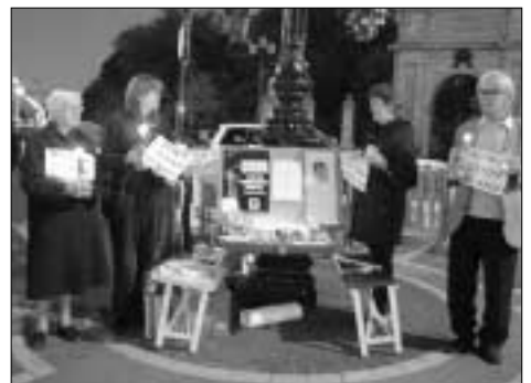
Burma Action Ireland held a vigil on Grafton Street in Dublin on 24 October to mark the day Burma's democracy leader, Daw Aung San Suu Kyi, completed eleven years in detention. BAI would like to thank all the volunteers who helped with this event.